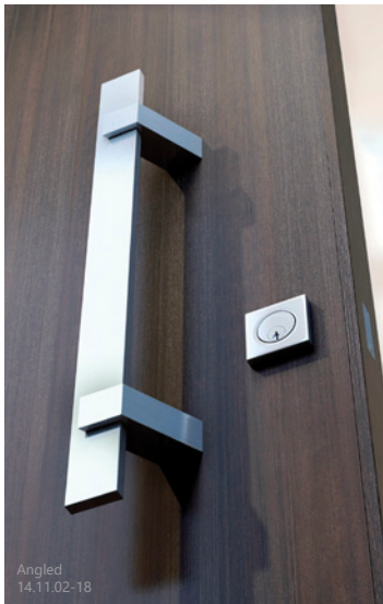
Brushed Stainless Steel Effect Aluminium 14.11.01-18 (Straight) / 14.11.02-18 (Angled)

Straight 40mm x 10mm aluminium handle in 800mm length (600mm centres). Available with either Straight or Angled external fittings to suit.