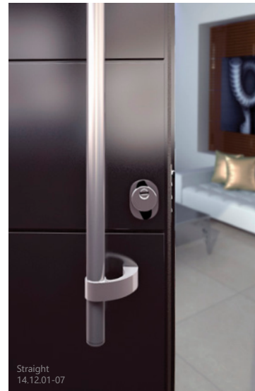
Stainless Steel 14.12.01-07

Straight Ø35mm 316 grade stainless steel handle, in 1000mm and 1600mm lengths with adjustable centres.